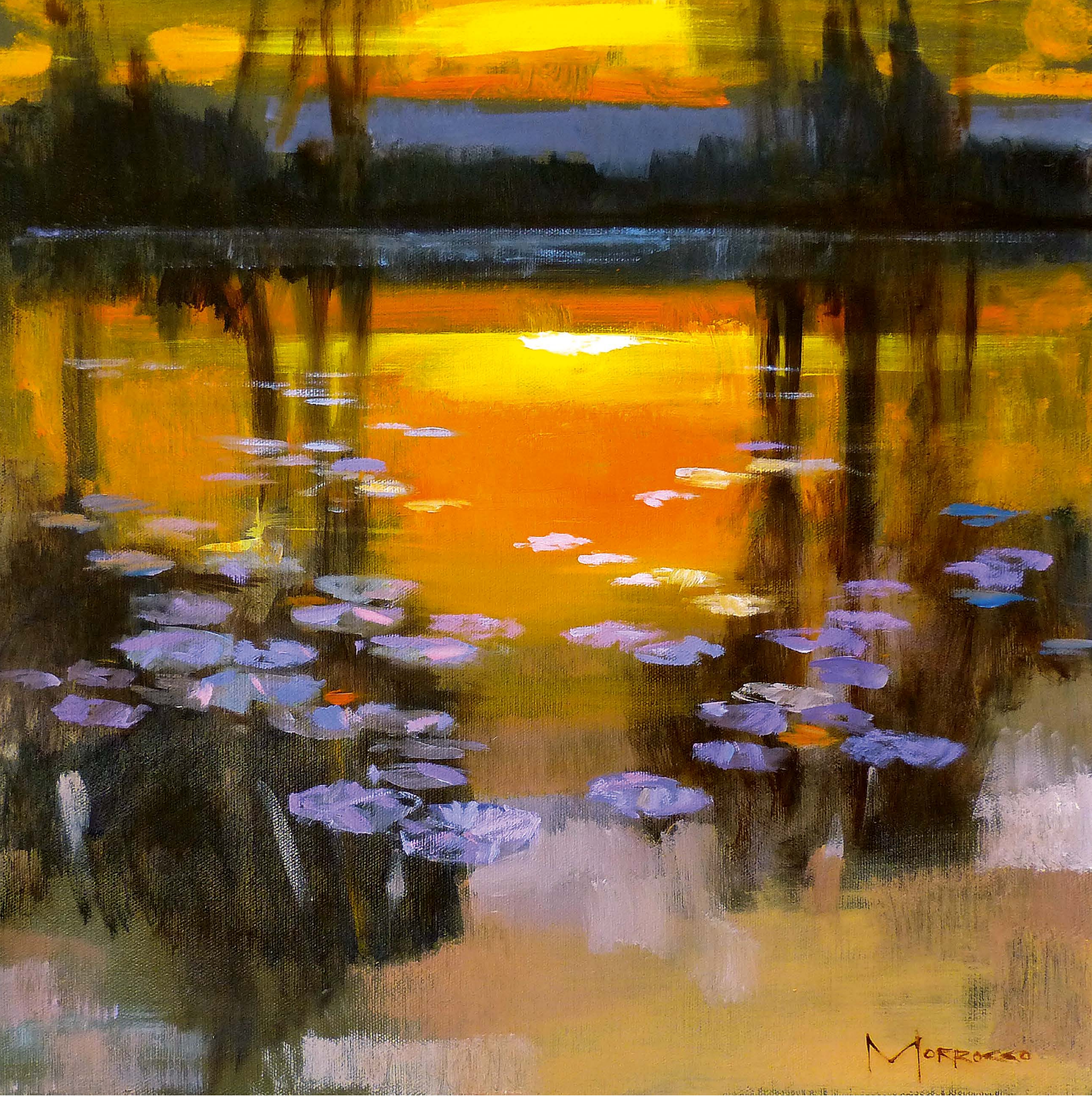
Lily Pond, Sun Setting by Jack Morrocco