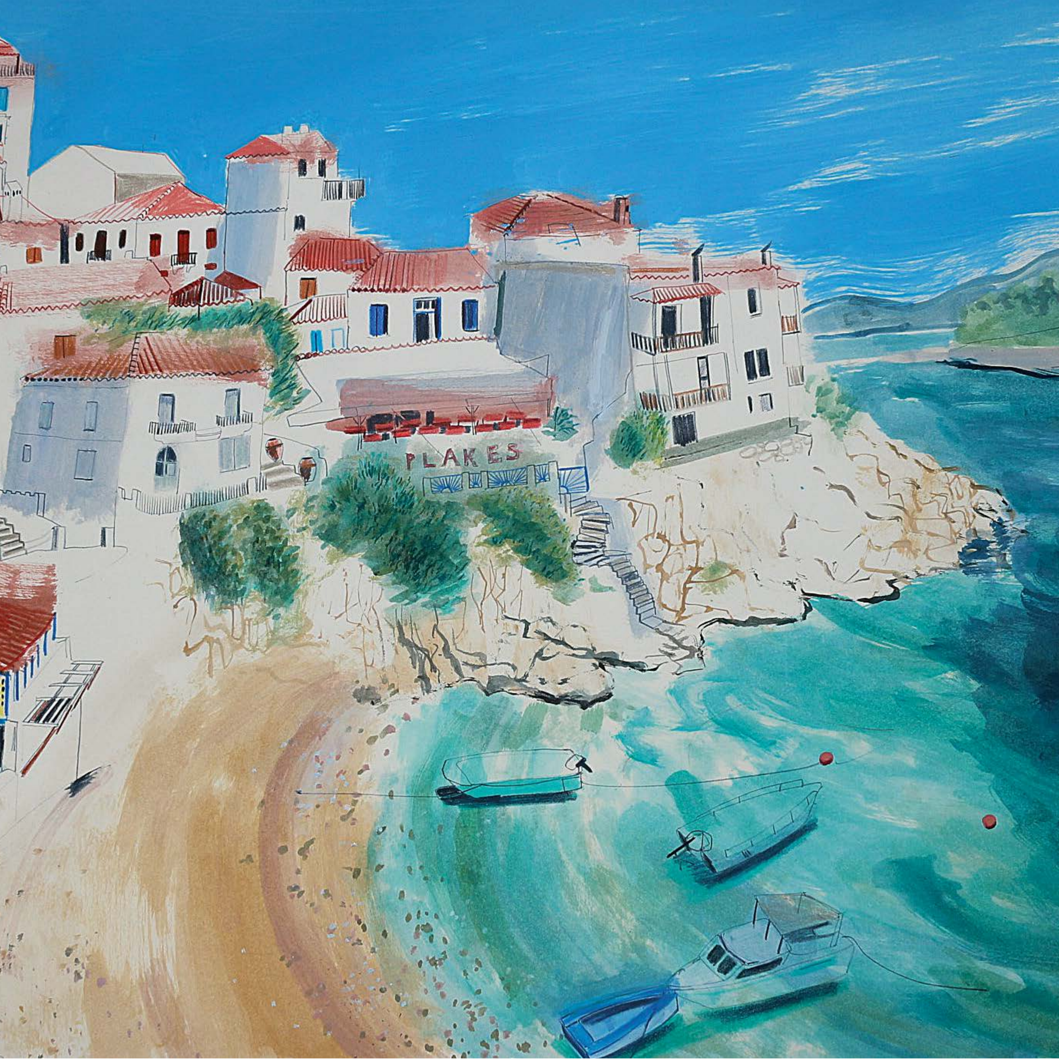
Turquoise Greek Bay by Jane Askey