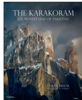
THE KARAKORAM | 2021 | ISBN 978-1-85894-687-0