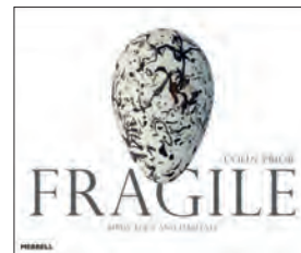
FRAGILE | 2020 | ISBN 978-1-85894-688-7