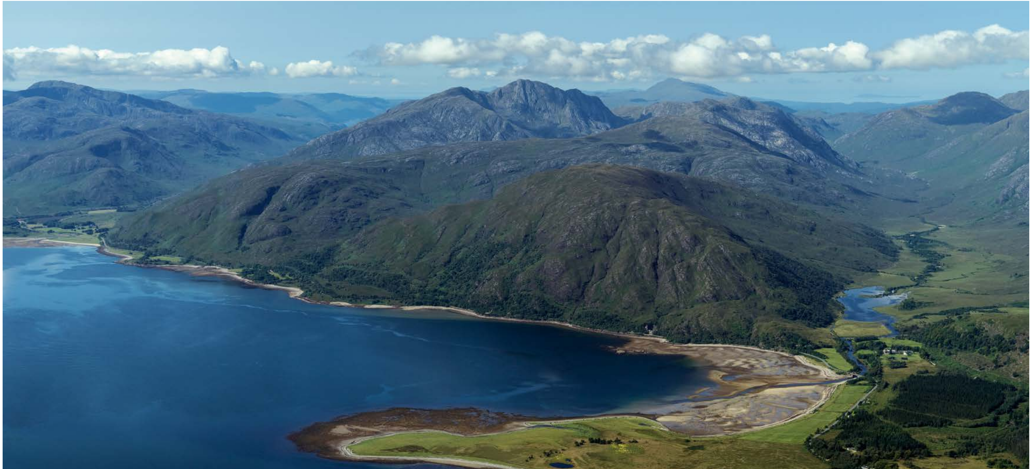
Garbh Bheinn and Glen Tarbert, Loch Linnhe, Ardgour