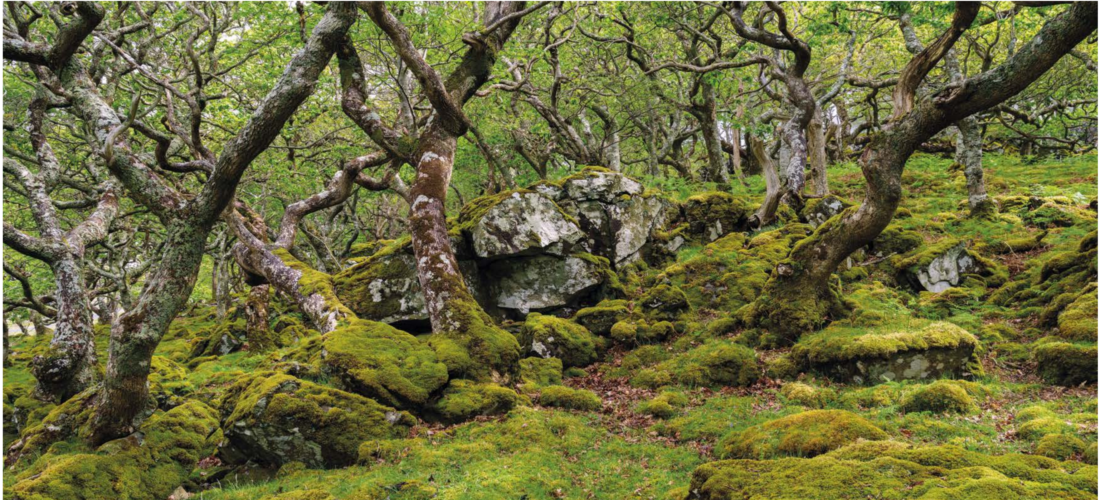
Scarisdale Wood, Knock Estate, Loch na Keal, Isle of Mull