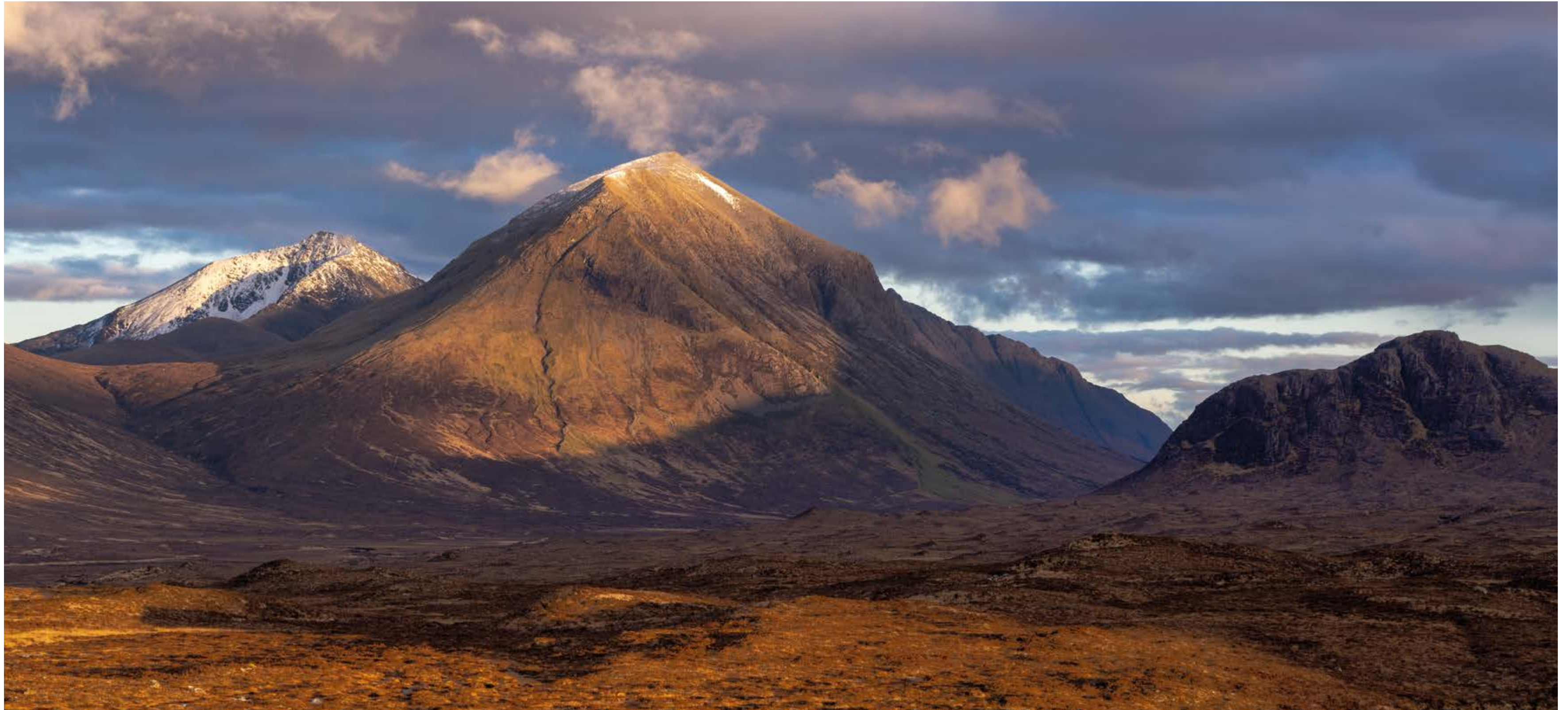
Garbh-bheinn and Marsco, Glen Sligachan, Isle of Skye