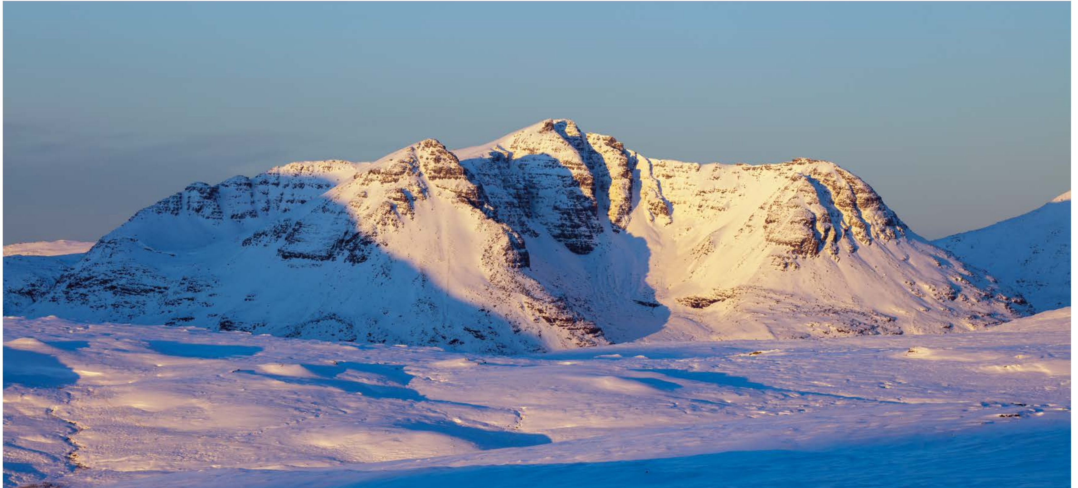
Beinn Dearg Mòr, Fisherfield Forest