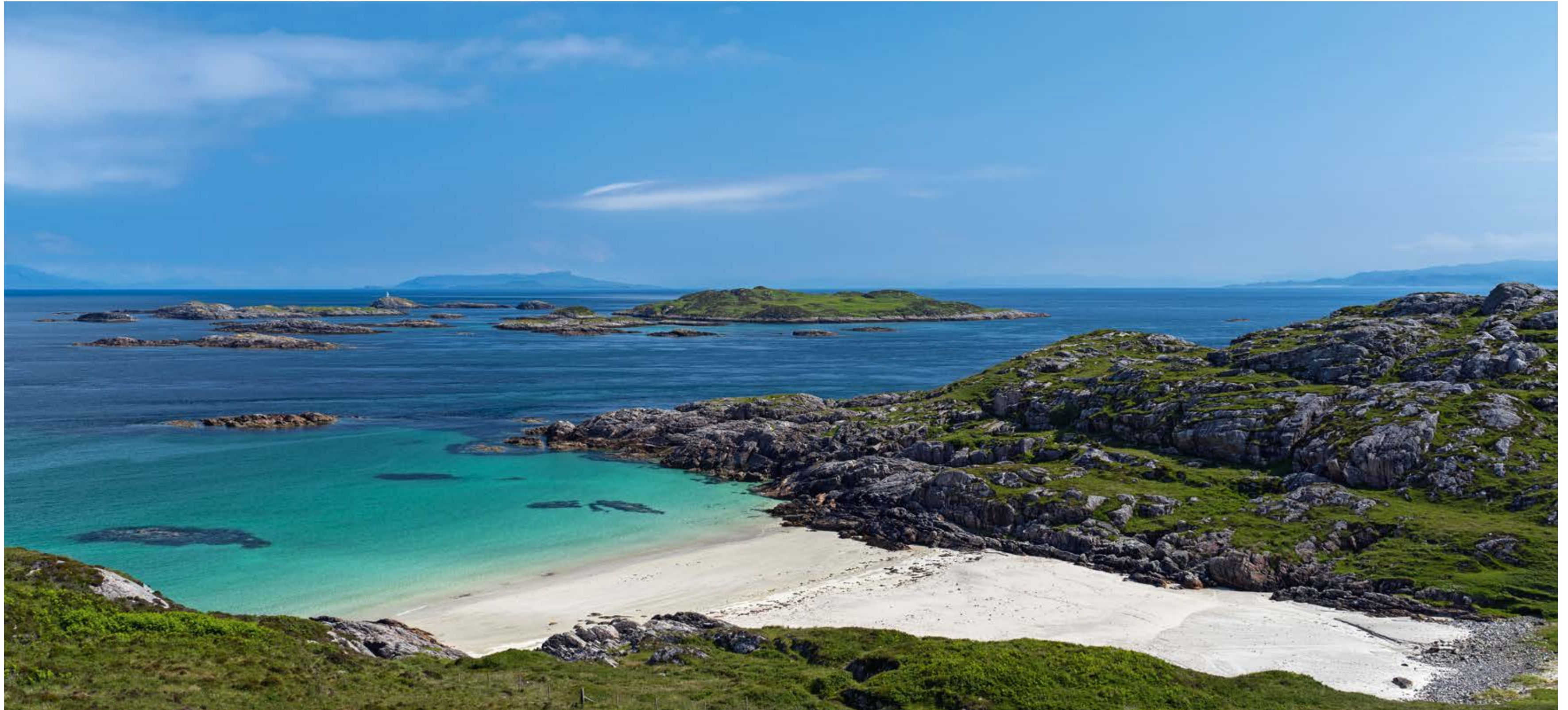
Eilean Mòr, and Eigg from Druim Nan Carn, Isle of Coll