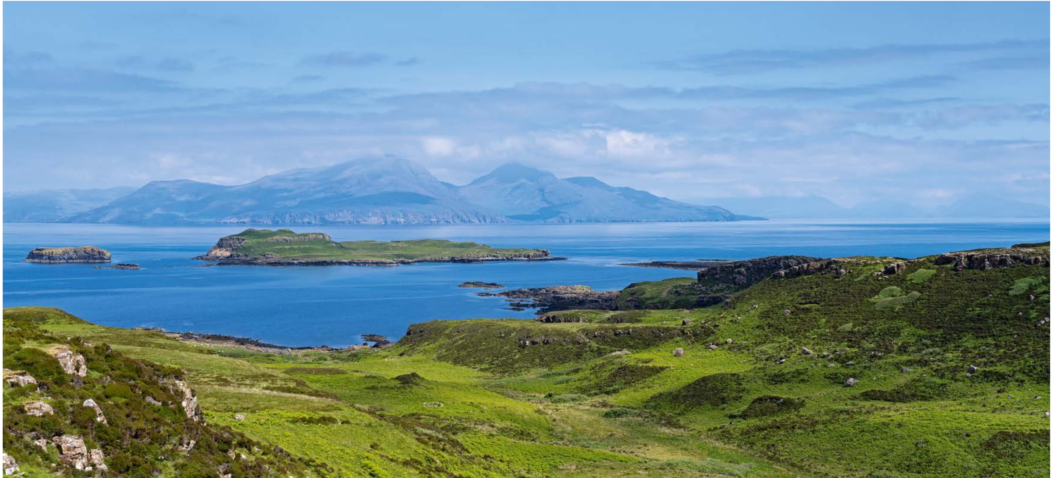
Horse Island and the Isle of Rùm, Gleann Mhairtein, Isle of Muck