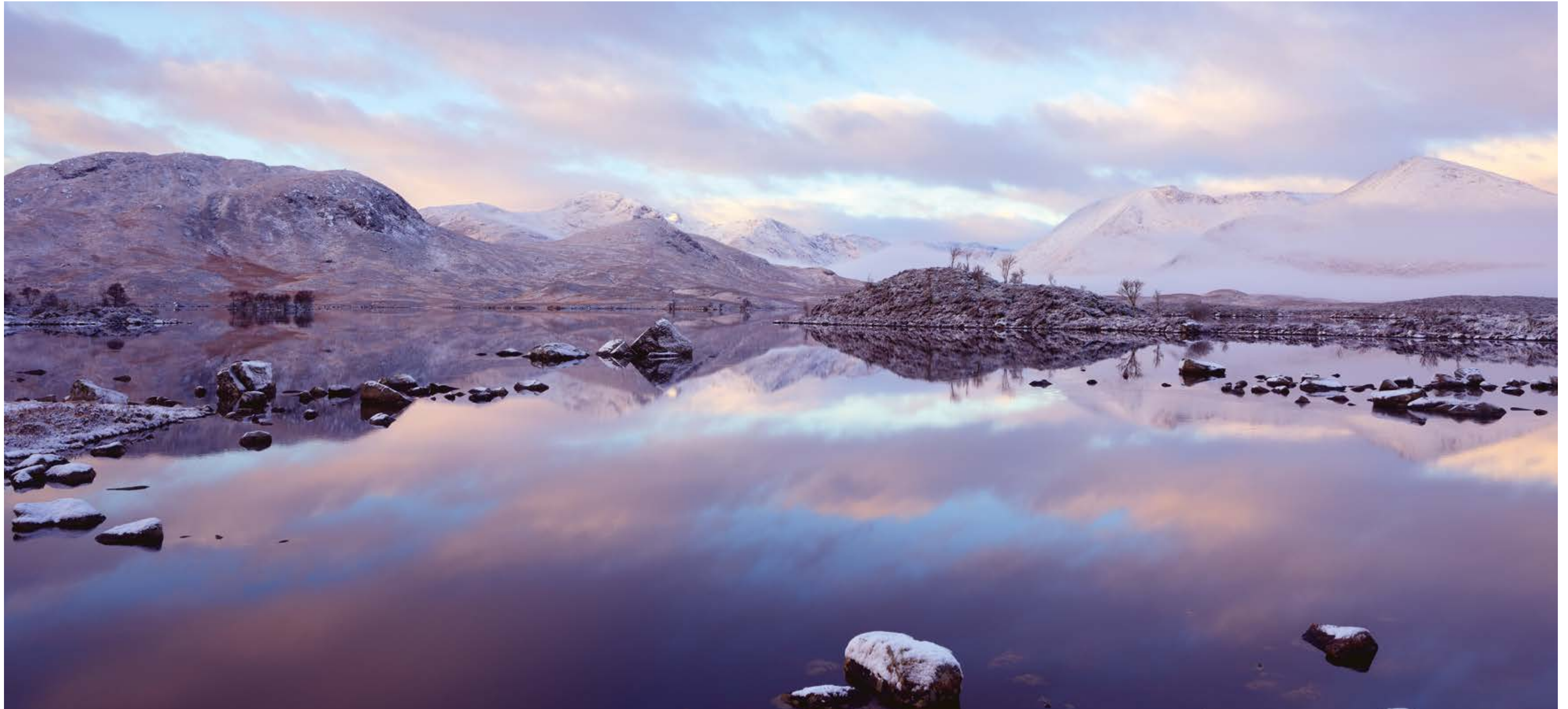
Black Mount, Lochan na h-Achlaise, Rannoch Moor