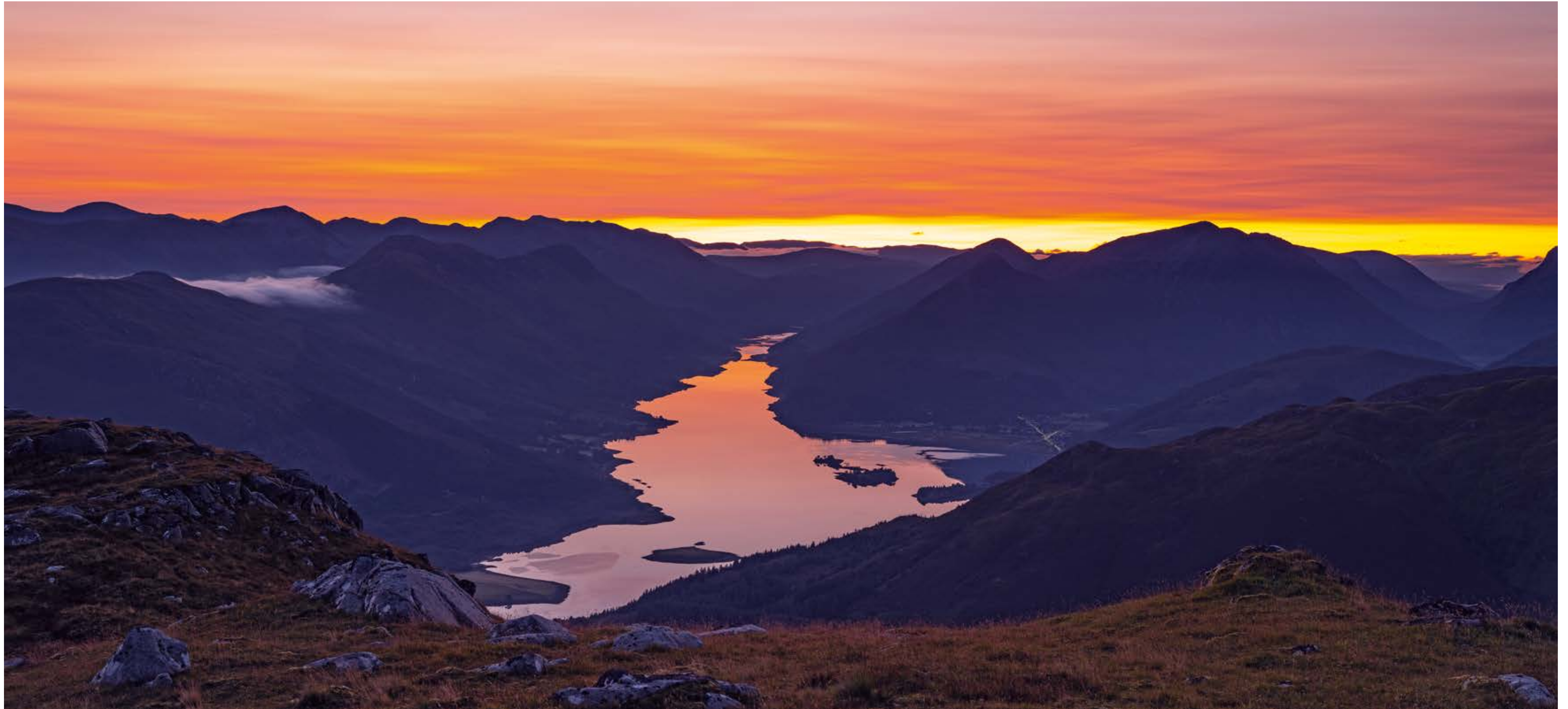
Loch Leven and the Pap of Glencoe, Glencoe