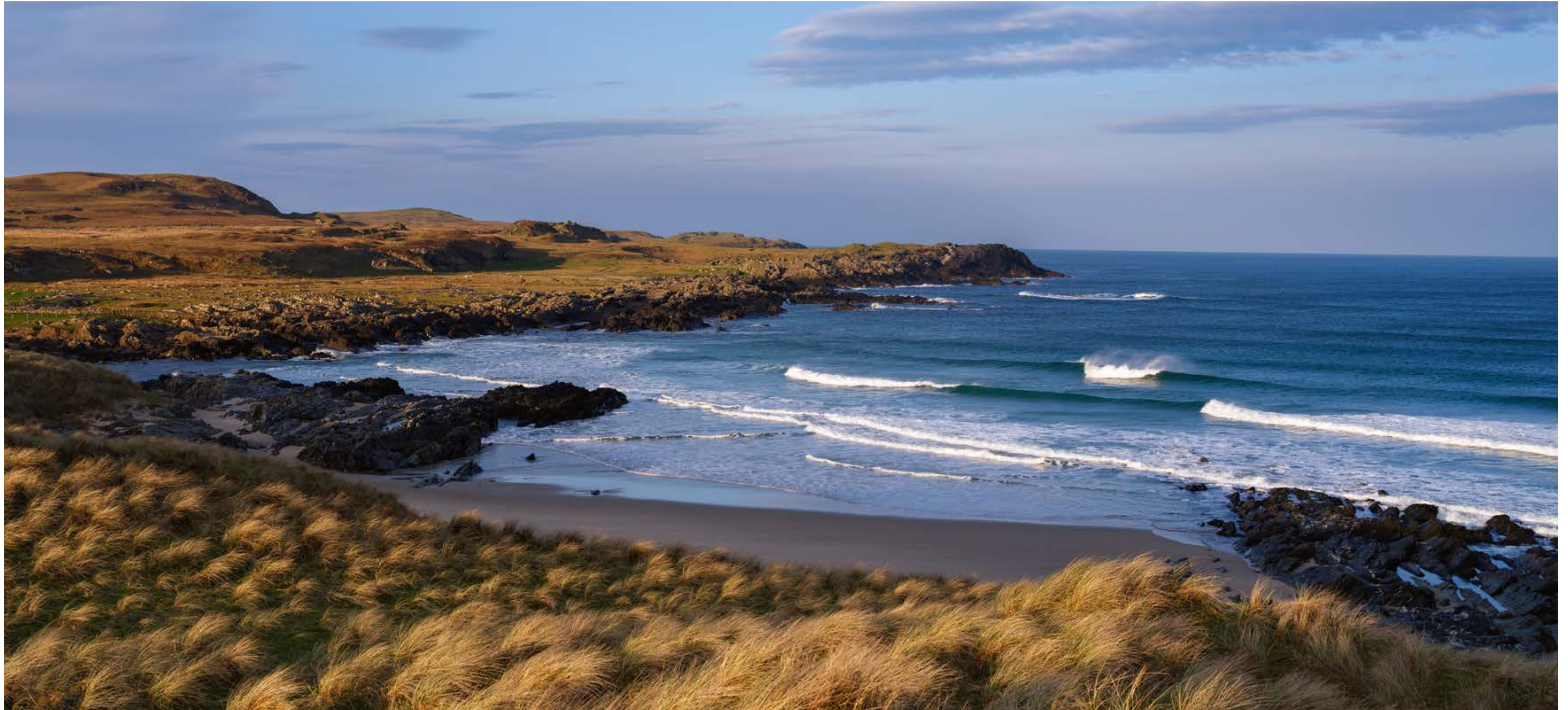
Saligo Bay, Rinns of Islay, Isle of Islay