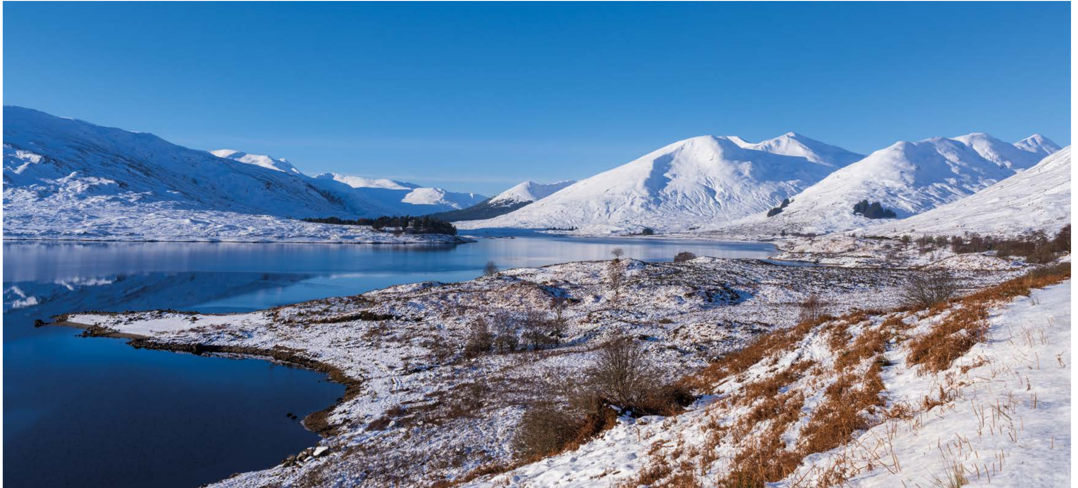
Aonach Meadhoin and Sgùrr an Fhuarail and Ciste Dubh, Loch Cluanie, Glen Shiel