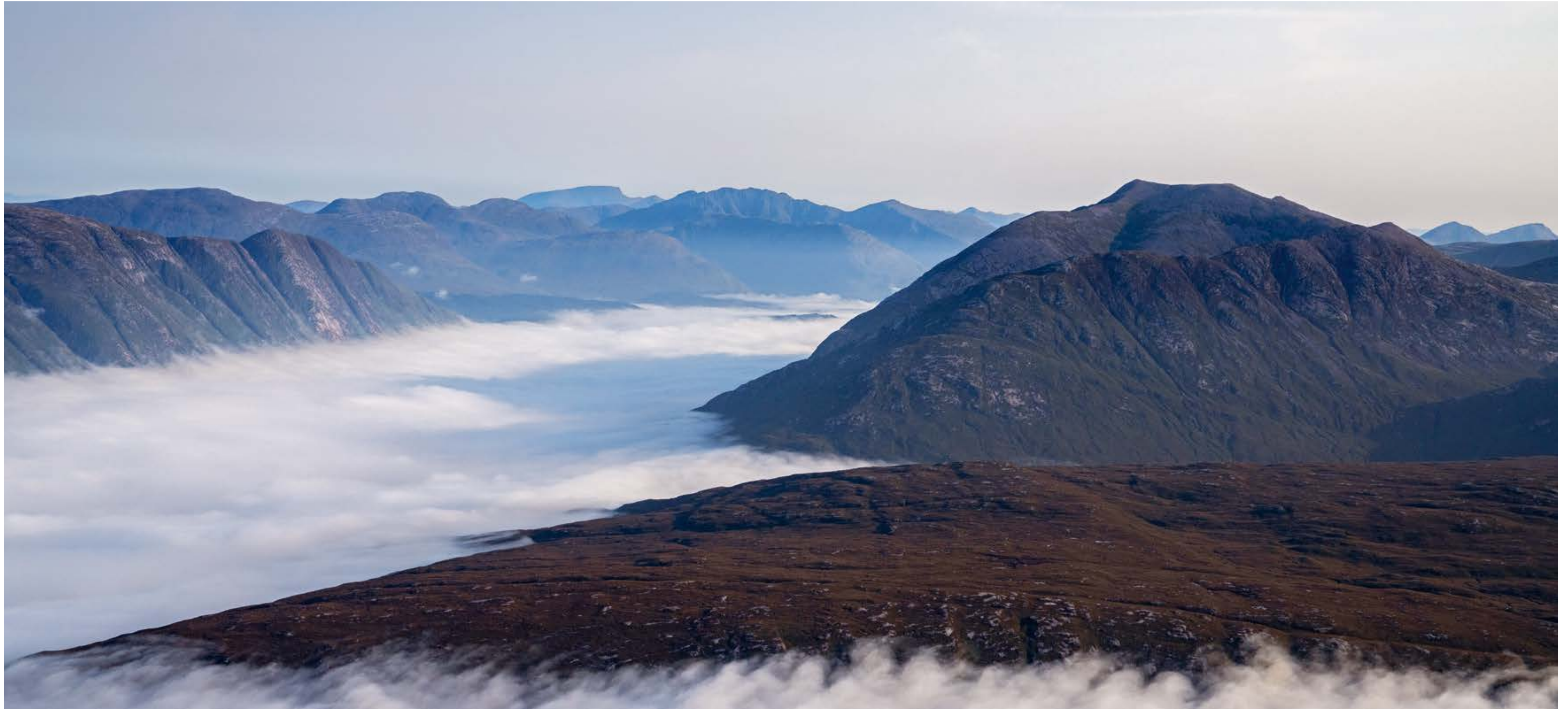
Ben Nevis, Bidean nam Bian and Ben Starav, Loch Etive