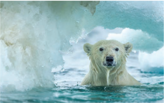
Polar Bear and Cubs. Polar Bears live along shores and on sea ice in the Arctic. When sea ice forms over the ocean, many Polar Bears, except pregnant females, head out onto the ice to hunt seals. Males can weigh up to 126 stone (800kg), and are twice the size of females. Polar Bears can also grow up to 9ft (3m) long, making them the largest bear species and the largest land carnivore in the world.