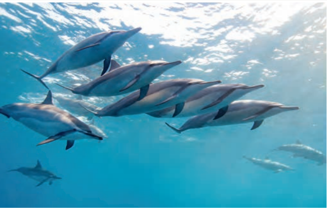
Punta Cana, Dominican Republic. The Dominican Republic is a Caribbean nation that shares the island of Hispaniola with Haiti to the west. It is known for its beaches, resorts and golfing. Its terrain comprises rainforest, savannah and highlands – including Pico Duarte, the Caribbean’s tallest mountain. Capital city Santo Domingo has Spanish landmarks like the Gothic Cathedral Primada de America, dating back five centuries in its Zona Colonial district.