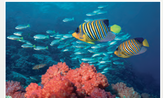
Ko Tapu, Phang-Nga Bay, Thailand. Phang-Nga Bay Marine National Park was declared a protected site of international ecological significance on 14 August 2002. It is a shallow bay with 42 islands, comprising shallow marine waters and intertidal forested wetlands, with at least 28 species of mangrove; seagrass beds and coral reefs are also present.