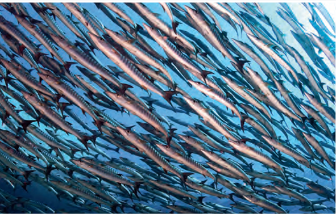
Barracuda Shoal. Widely distributed around the world, Barracudas are commonly found in tropical regions with warm water and plenty of food. They prefer shallower, coastal waters of less than 330ft (100.5m) deep, typically close to coral reefs, shorelines and continental shelves. Capable of incredible bursts of speed, and with a menacing mouth full of needle-like teeth, these ferocious fish are perfectly evolved for hunting.