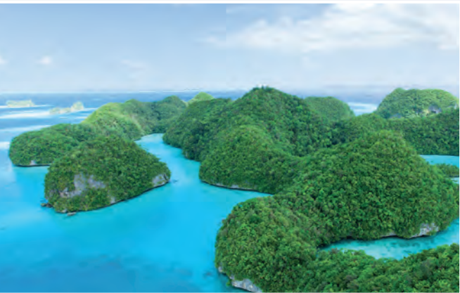
Palau Islands. Palau is a country in the western Pacific Ocean. It consists of some 340 coral and volcanic islands perched on the Kyushu-Palau Ridge. Palau has more species of marine life than any other area of similar size in the world. Corals, fish, snails, clams, sea cucumbers, starfish, sea urchins, sea anemones, jellyfish, squid and feather-duster worms exist in profusion and variety.