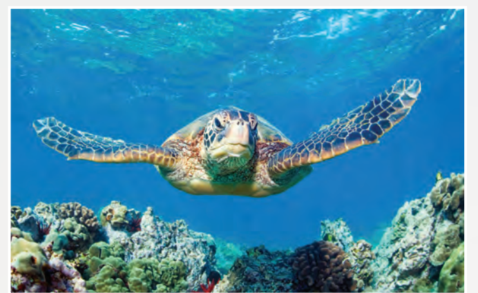
Green Sea Turtle. The Green Sea Turtle is one of the largest sea turtles and the only herbivore among the different species. They are, in fact, named for the greenish colour of their cartilage and fat, not their shells. Green Sea Turtles are found mainly in tropical and subtropical waters. Like other sea turtles, they migrate long distances between feeding grounds and the beaches from where they hatched.