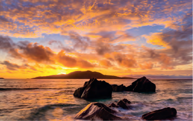
La Digue, Seychelles, Indian Ocean. The Seychelles is one of the world's smallest countries, composed of two main island groups: the Mahé group of more than 40 central, mountainous islands; and a second group of more than 70 outer, flat, coral islands. Of the roughly 200 plant species found in the Seychelles, some 80 are unique to the islands – the most famous of these being the Coco de Mer, which is found on only two islands.