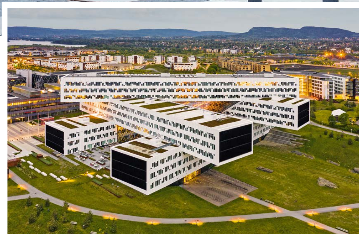
Equinor Oslo, Fornebu, Norway

A bold modular design, the Oslo offices for the energy company Equinor comprises five identical lamellae stacked on top of one another, crisscrossing and overhanging. The modules are orientated differently to optimise internal daylight conditions and views towards the fjord landscape.