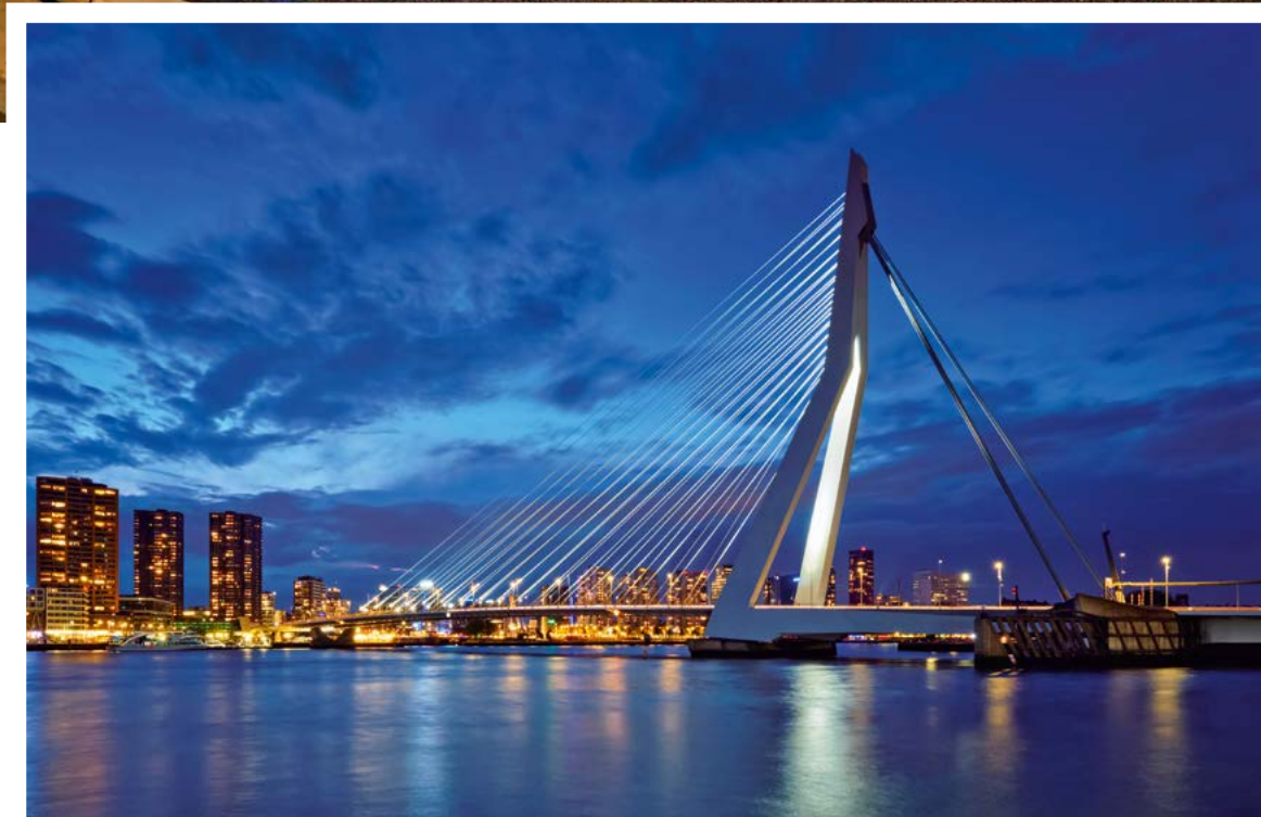
Erasmus Bridge, Rotterdam, Netherlands

A combined cable-stayed and bascule bridge, with hardly any straight angles, the 802m bridge spans the Maas river linking the north and south of the city. It has a 139m-high steel pylon, secured with 40 cables. The shape of the pylon gave the bridge its nickname, 'The Swan'.