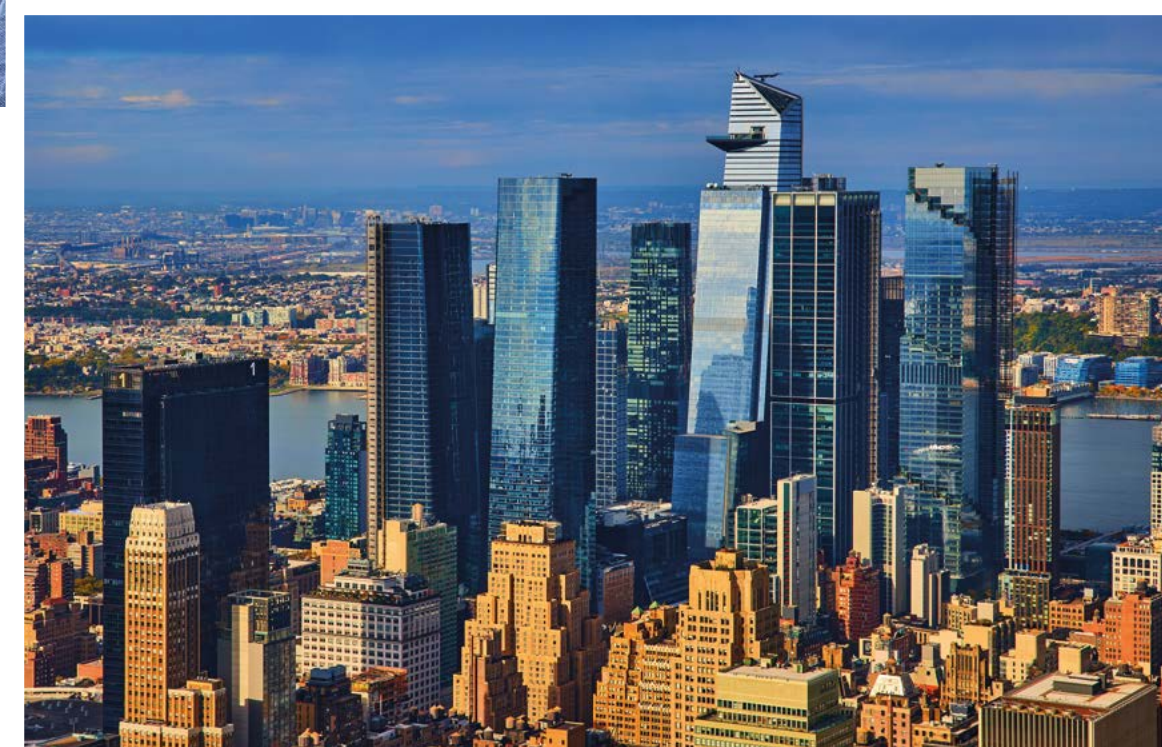
Edge, Hudson Yards, New York, USA

This tower's sky deck is the highest in the Western Hemisphere. Suspended in mid-air, 100 storeys high, it seems to float in the sky. It has a breathtaking glass floor, leaning out on angled glass walls. Guests can sip champagne in the sky and admire 360-degree city views.