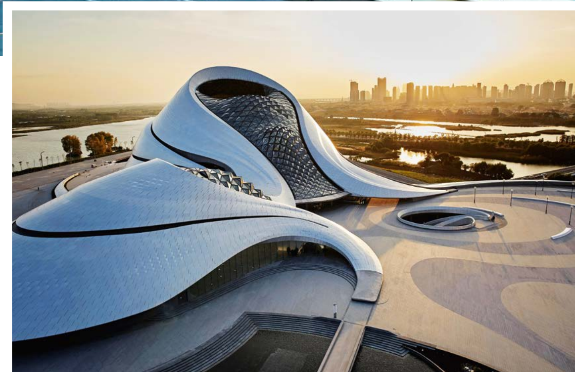
Harbin Grand Theatre, Heilongjiang, China

The sinuous design of this performing arts centre for Harbin Cultural Island, swathed entirely in white aluminium panels, blends in with the harsh landscape, swooping and swirling like a snowdrift. The interior achieves harmony with white walls, skylights and tons of timber.